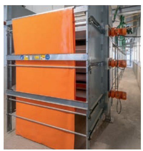
Six-tier manure drying tunnel