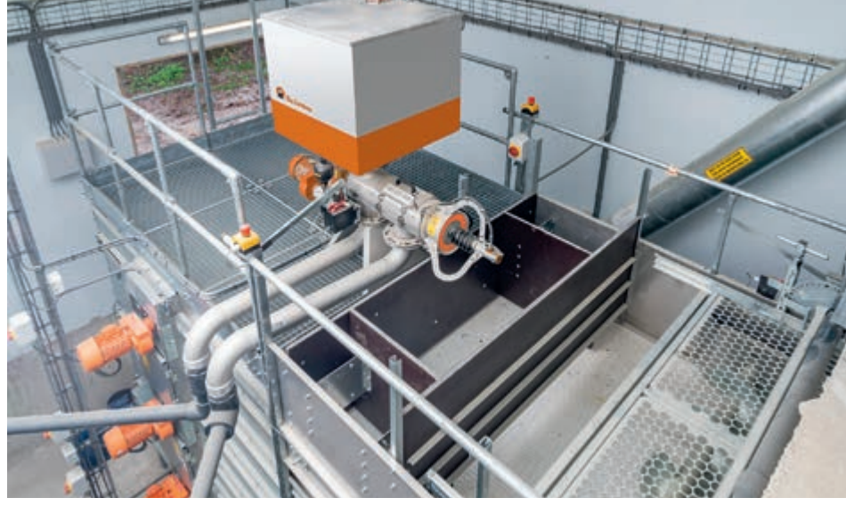
A screw press separates the untreated slurry into a solid and a liquid proportion

The separated liquid is stored in a tank. In two tiers of the drying tunnel, the sediment from the liquids tank is added to the material to be dried. This procedure increases the nutrient concentration in the solids and reduces the amount of liquids.