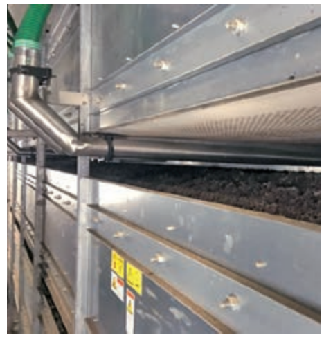
A distribution system sprays the liquid proportion evenly onto the material that is to be dried

For the drying process, fans push the warm exhaust air from the barn into the pressure corridor. Inside, the air passes through all tiers of the drying tunnel from one side to the other along its entire length. The perforated manure belts ensure that the warm air passes not only over the material but through it, which increases the drying efficiency considerably. The result is separated solids with a dry matter content of up to 85 percent!