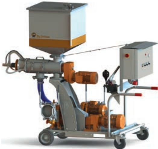
OptiPress 400 with a capacity of 8 to 16 m³/h

Storage is also easier because no homogenisation is necessary. Purchasing one of the two separators from Big Dutchman, you buy high-quality technology at an attractive price : performance ratio. Let our experts advise you on how to find the best solution for your individual needs.