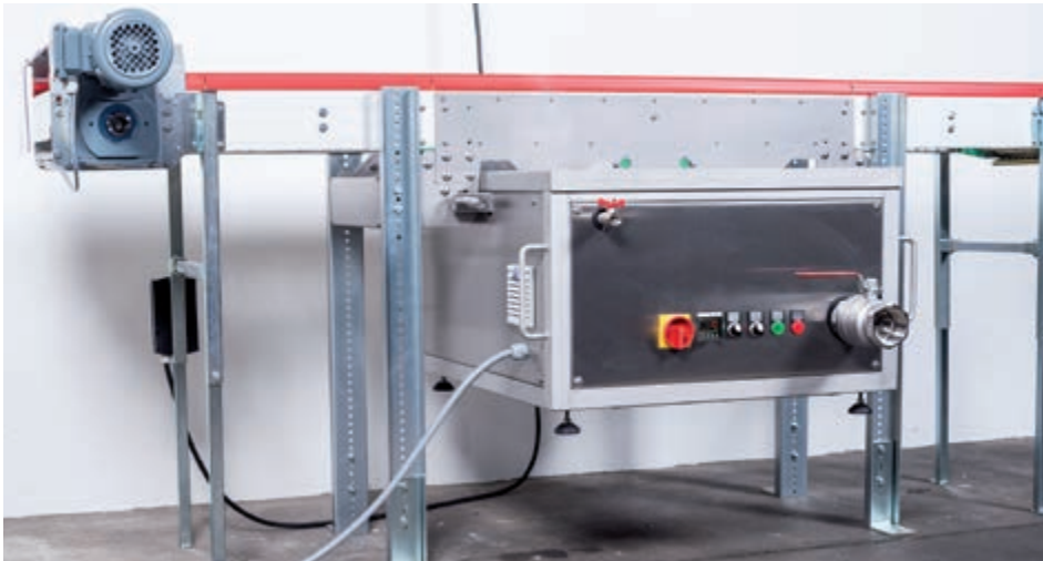
Compact cleaning unit: requires little space and no deflection unit above the conveyor

of chain before the basin has to be refilled, while the larger unit cleans chain sections of up to 600 m. Depending on the degree of contamination, multiple repetitions may become necessary.