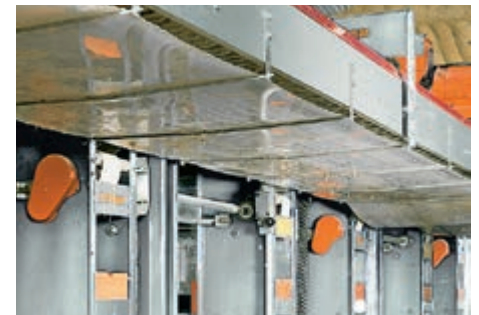
Cross collection in parking position

Due to the specially designed control system, the longitudinal belts can be reversed just before the cross collection moves to the next tier. Eggs located in the critical area of the transfer point are thus moved into a safe position. The lift system can be connected to rod or curve conveyors with a width of 350 mm, 500 mm or 750 mm. Differences in height are compensated by means of a telescopic unit.