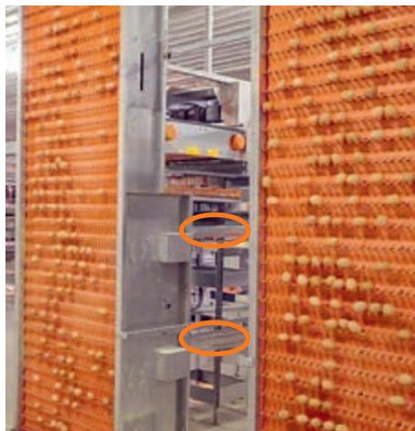
EC elevator with integrated system egg collection

The EC elevator is able to collect large numbers of eggs. Especially in multi-level houses (up to three levels), the elevator can be equipped with an extra wide elevator chain and is thus an efficient egg collection system: it does not require much space and collects up to 15 000 eggs per hour. A new feature is the option for "system egg collection": the elevator can simultaneously collect eggs mislaid in the system. All belts either run into the elevator in parallel or system eggs are collected separately.