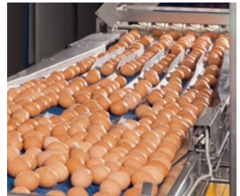
Optimum utilisation of the grader at all times