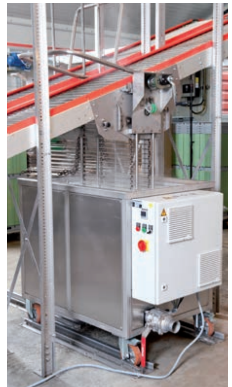
Cleaning unit: for a maximum conveyor width of 750 mm