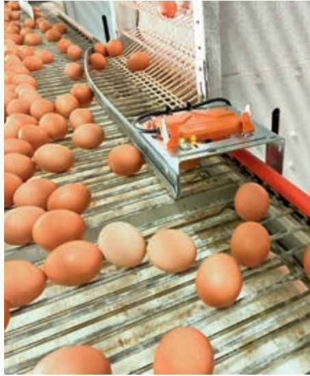
EggScan 120 at the cross belt

The EggScan 120 egg counter offered by Big Dutchman records every egg with an accuracy of up to 99.8 percent. EggScan 120 has a scanning width of 120 mm (4.7 inches) and is thus ideal for smaller belts. The egg counter can be installed either at the longitudinal egg belt in every tier or at the cross belt. It is easy to integrate into the counter network using a "press & ready" plug. The Big Dutchman product range includes further egg counting systems. Let our experts help you find the optimum solution for your individual requirements.