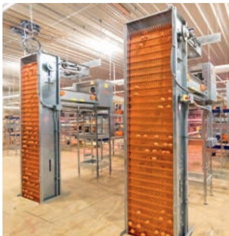
EC elevator in a multi-level house

Space-saving option, large collection capacity