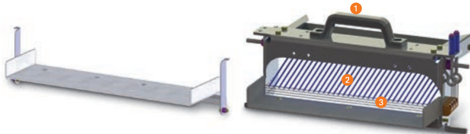
Standard transfer unit