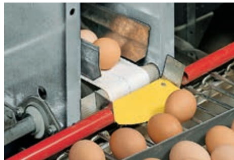
Egg transfer from longitudinal belt to cross belt

Due to the specially designed control system, the longitudinal belts can be reversed just before the cross collection moves to the next tier. Eggs located in the critical area of the transfer point are thus moved into a safe position. The lift system can be connected to rod or curve conveyors with a width of 350 mm, 500 mm or 750 mm. Differences in height are compensated by means of a telescopic unit.