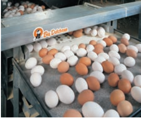
Manual collection table

Simple manual collection tables (without drive) are mainly used for small units or if several houses are planned but not yet finished. If this is the case, a manual collection table is installed until it can be replaced by a cross collection.