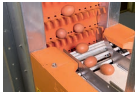
Egg transfer from the longitudinal belt to the rod conveyor and onto the elevator chain